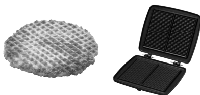
Butter waffles 16X28 - M004