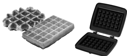
Waffles from Brussels and Liège 4X6 - M001