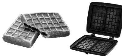
Stuffed waffles 4X7 - M008