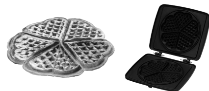
Heart shaped waffles M006