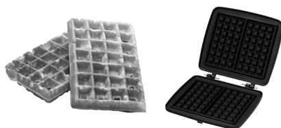
Traditional waffles 4X7 - M002