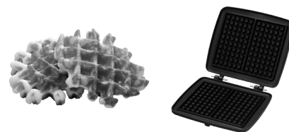
Thin crispy waffles 6X10 - M003